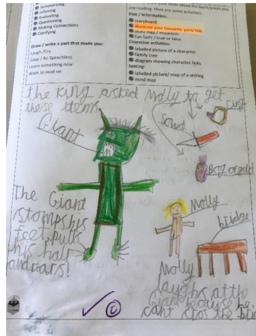
Illustrate your favourite part Example 2